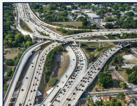
Downtown Tampa Interchange (I-275/I-4)