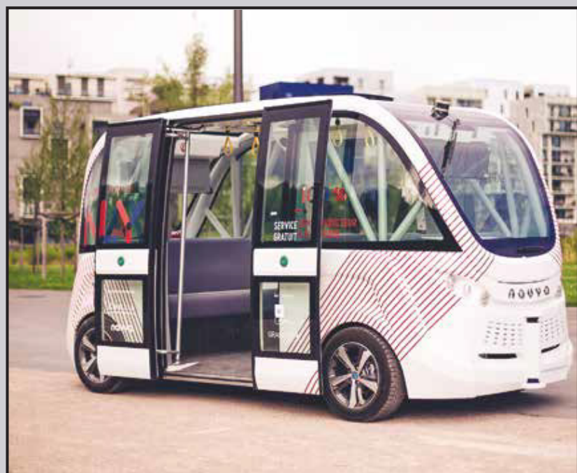
Autonomous Vehicle Projects